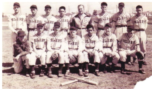
1951 PHS District Champions – At home field Zychlinski Park