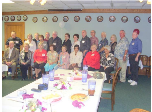
PHS Class of 1959